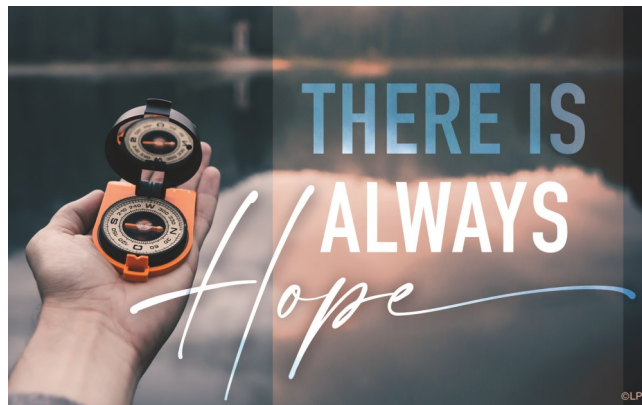
Published by the Pastoral Centre. All rights reserved.

Pope Francis points out repeatedly in his encyclical Laudato Si’ that environmental degradation affects the poor and vulnerable the most. What can you do this week to offer special protection or care to the poor who are suffering from extreme weather events or other environmental impacts (lack of clean drinking water, crowded and unsanitary living conditions, etc.)?